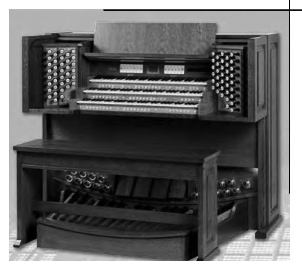
Rembrandt 397 Epiphany Lutheran Church Baltimore, Maryland To be interfaced with existing 15-rank Möller

European quality and design now in America