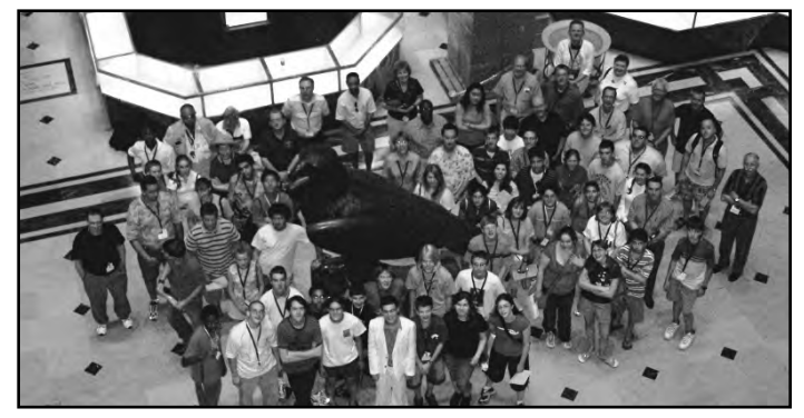
Shot of the entire POE in the Grand Court of the closed Macy's store, taken from the console of the Wanamaker Organ on Wednesday, just after a cheese steak dinner